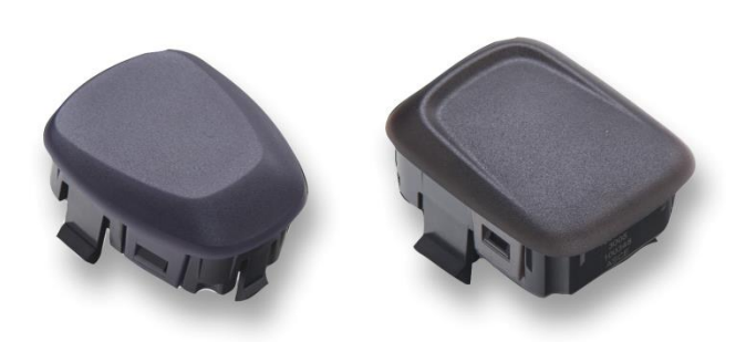
Figure 1: Multizone Solar Sensors