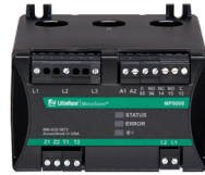
MP8000 Bluetooth Overload Relay

This smart, universal relay can communicate directly with your smartphone or tablet via Bluetooth. No need to open the control panel. Monitor and control unlimited relays through the Littelfuse MP8000 app on your smartphone or tablet from a safe distance.